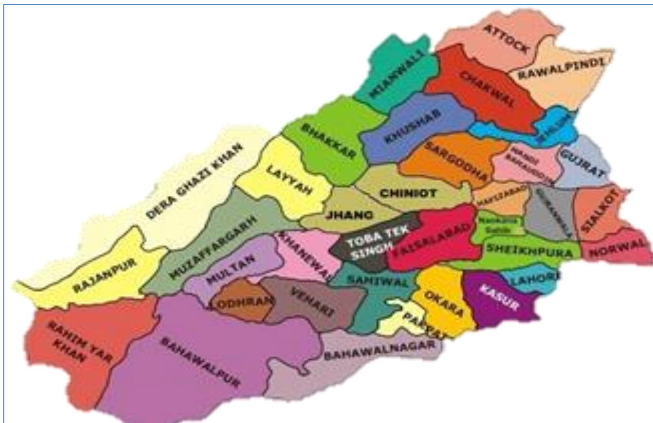
Figure: Location Map of the Project Area (Punjab)